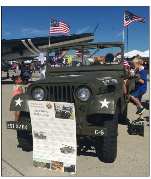
The Post Jeep at This Year's Dulles Plane Pull

Dennis Boykin is looking for volunteers to become drivers, help maintain the vehicle and participate in events and shows, such as the air shows. If interested, please contact the post at contact I I 177@vfw I I 77.org \mathfrak A